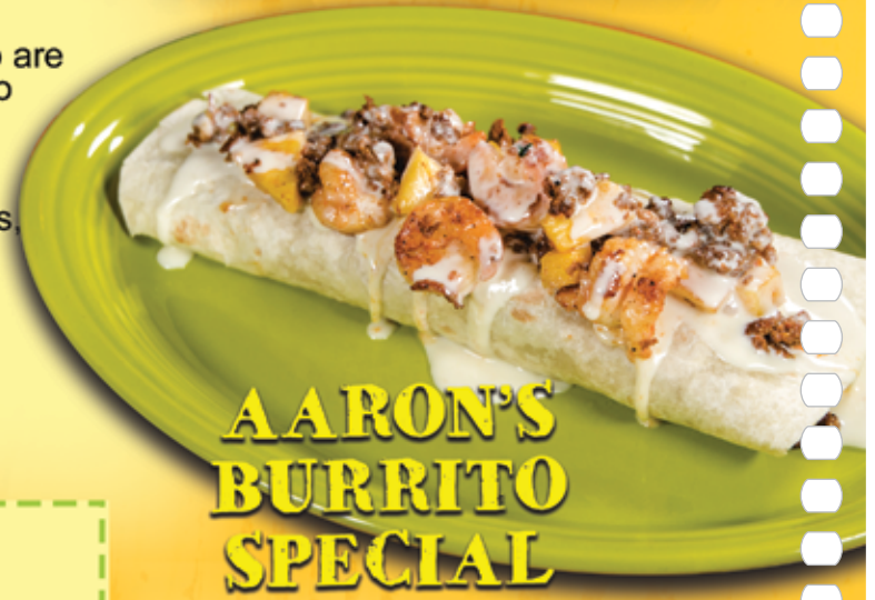
AARON'S BURRITO SPECIAL