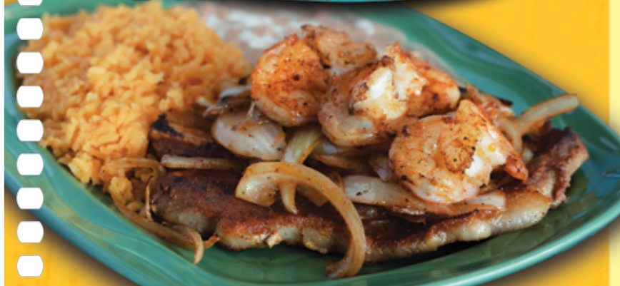
STEAK & SHRIMP