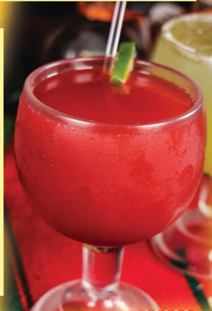
CHICKEN - STEAKS

Ribeye steak with grilled mushrooms served with lettuce, guacamole, sour cream, pico de gallo, rice and beans. 12.99